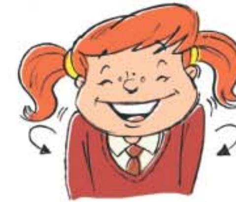
4. Shoulder shrug