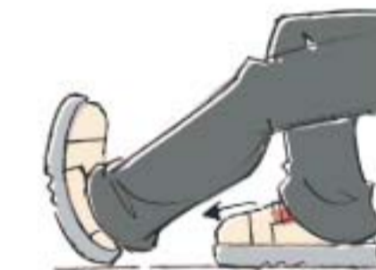
7. Heel touch