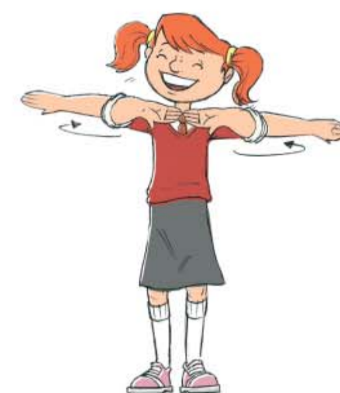
6. Breast stroke