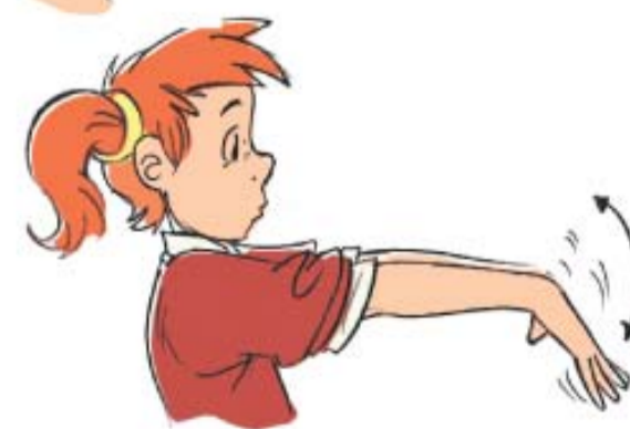
2. Wrist wrencher