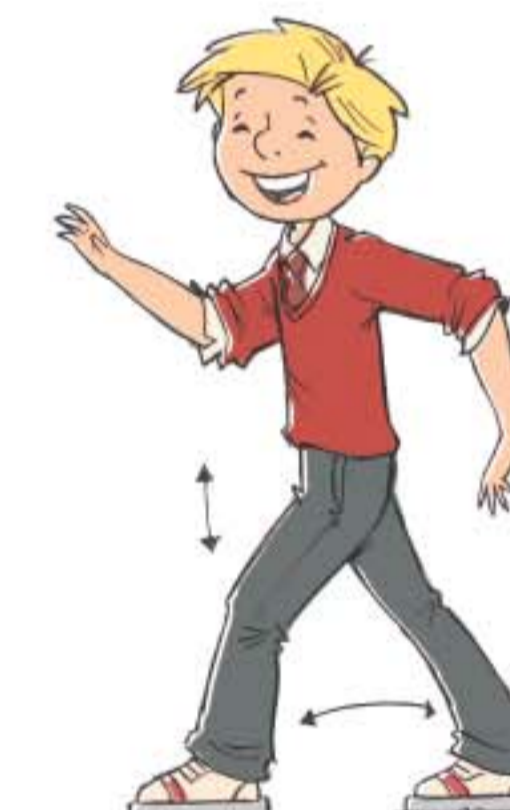
7. Split bounce