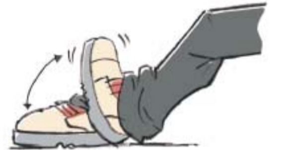
8. Press & pull