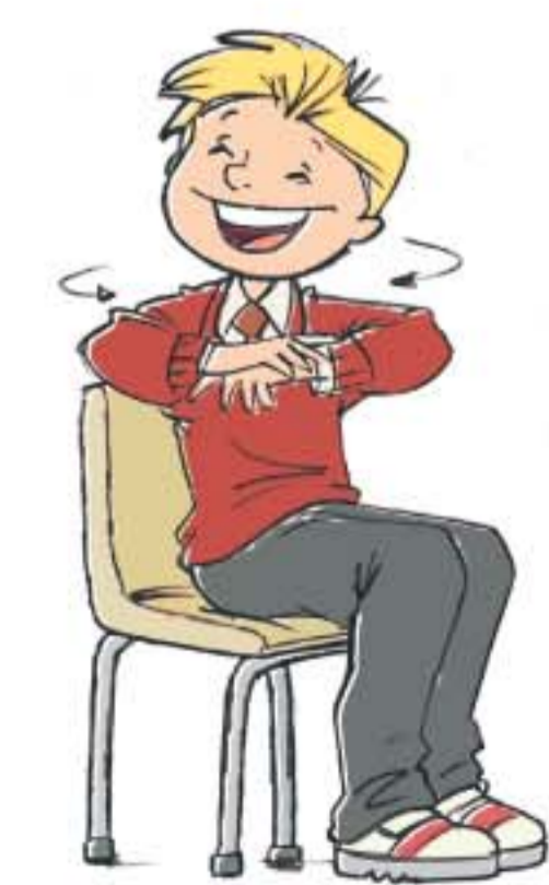
8. Trunk twister