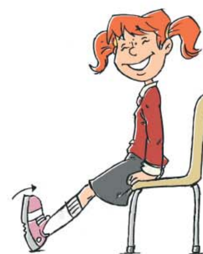
5. Calf stretcher