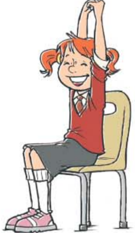
9. Reacher upper