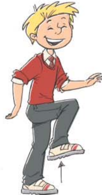
2. Hup march