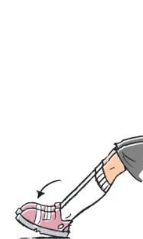
6. Shin stretcher