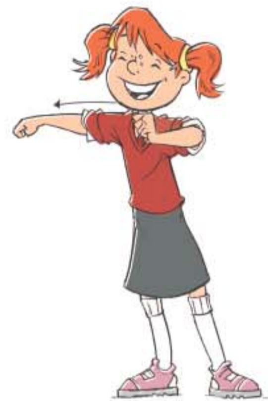
3. Punch bag