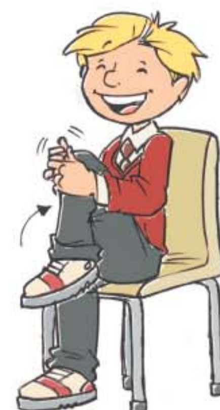
4. Bum stretcher