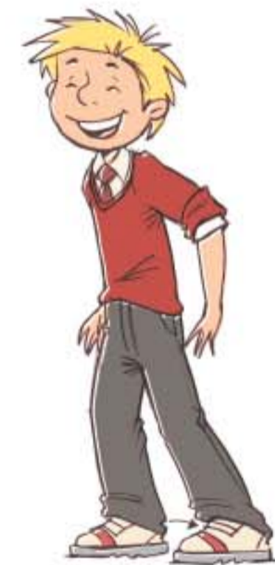
4. Side step