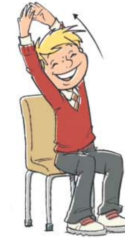
5. High reach