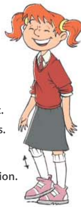
1. Spot walk