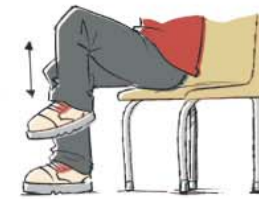
6. Slo-mo march