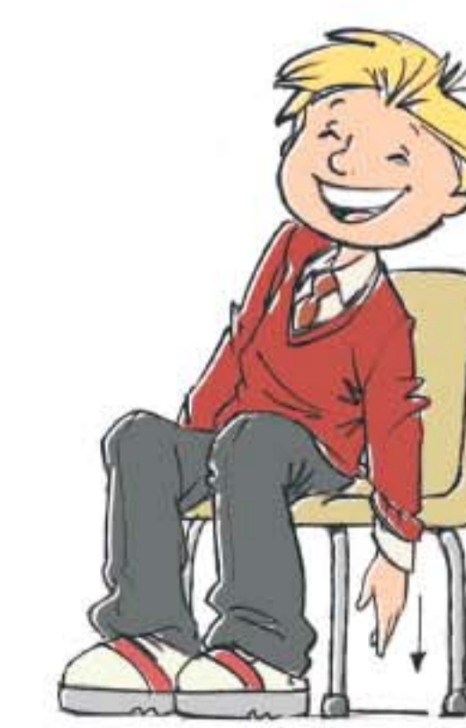
7. Side benders