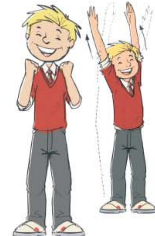
8. Sky punch