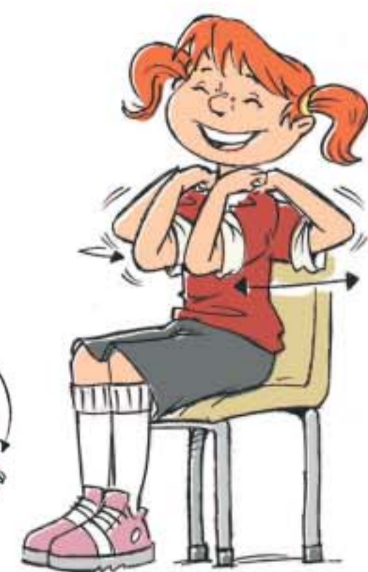
3. Wing wings